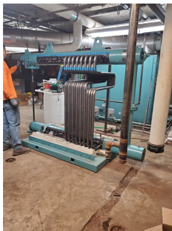
Day 1 of the on-site build