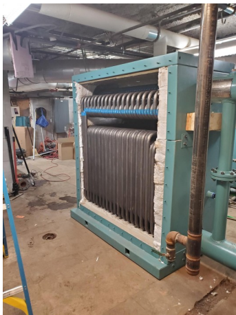
Day 4 successful hydro test