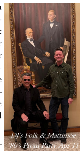
DJ's Folk & Mattimoe '80's Prom Party, Apr. 11

The crew from Titan has dismantled the old boiler and started step by step assembly of the new one in our basement. Check out page 3 to see pictures of the installation. Bill thinks the new unit will be up and running before the end of March — just in time for spring!