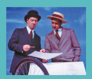
THE WRIGHT STUFF